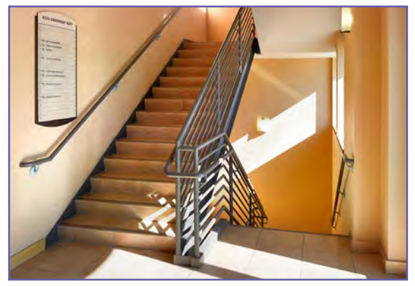
Access to Fitness Center at 8401Greenway