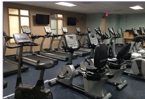
Access to Fitness Center at 525 Junction Rd.