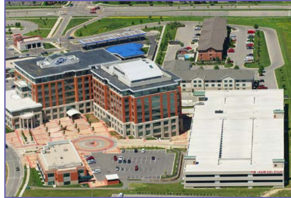
Parking Options / Surface and Ramp