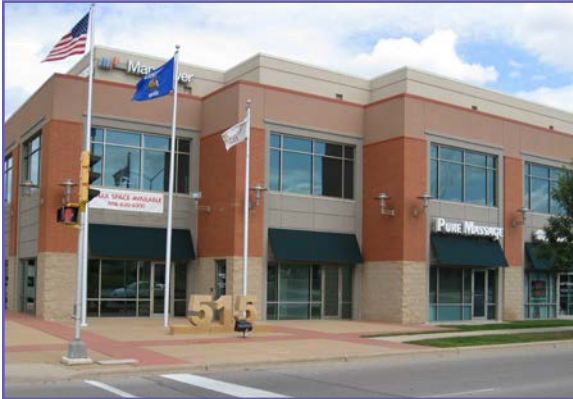
Building Signage Opportunities