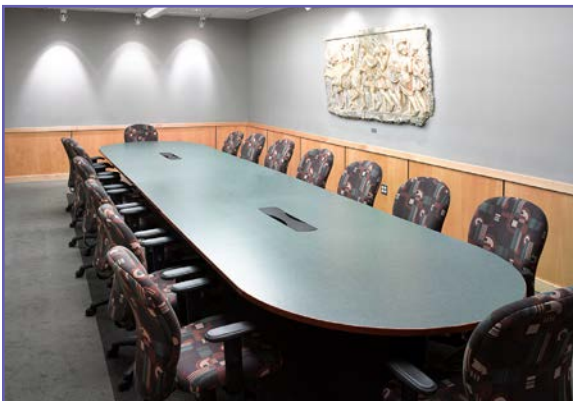
Access to Board Room at 525 Junction Rd.