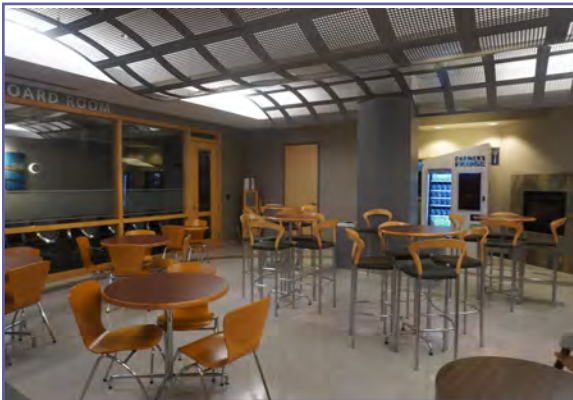
Access to Cafe at City Center West