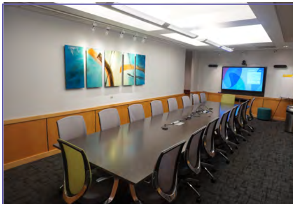
Access to Board Room at City Center West