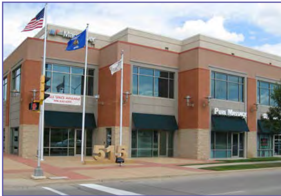
Building Signage Opportunities (1st Floor Only)