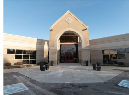
1232 FOURIER DRIVE 1232 FOURIER DRIVE MADISON, WI