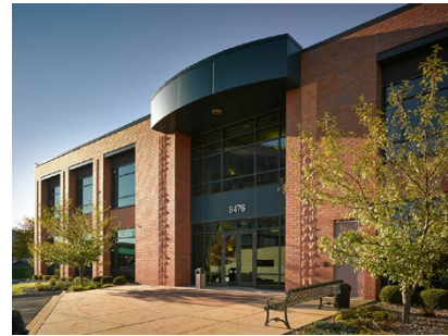
8476 GREENWAY BLVD 8476 GREENWAY BLVD MIDDLETON, WI