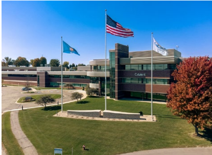
726 HEARTLAND TRAIL 726 HEARTLAND TRAIL MADISON, WI