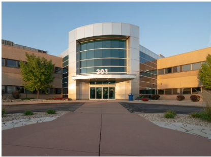
301 SOUTH WESTFIELD RD 301 SOUTH WESTFIELD RD MADISON, WI