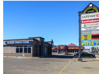
NORTHERN LIGHTS SHOPPING CENTRE I 9531-9623 FRANKLIN AVE FORT MCMURRAY, ALBERTA