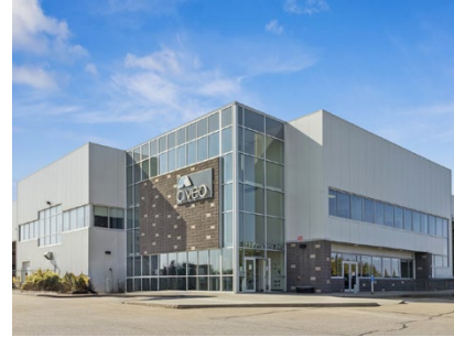
CIVEO BUILDING 53021 RANGE RD 263A ACHESON, ALBERTA