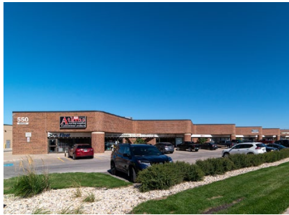
PRUDENTIAL PARK 3 550 CENTURY ST WINNIPEG, MB