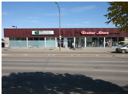
100 SIGNAL RD 100 SIGNAL RD FORT MCMURRAY, ALBERTA