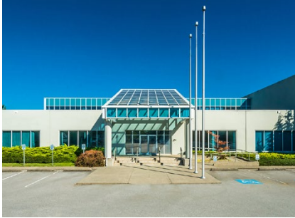
CLIVEDEN BUILDING 1608 CLIVEDEN AVE DELTA, BRITISH COLUMBIA