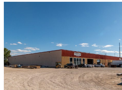
NATIONAL ENERGY BLDG 1431 CHURCH AVE WINNIPEG, MB