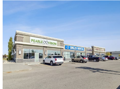
CENTURY CROSSING III 141 CENTURY CROSSING SPRUCE GROVE, ALBERTA