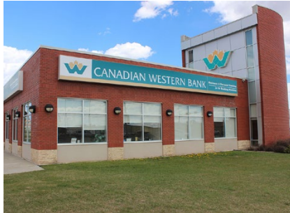
BRICK CENTRE 11226 - 100 AVE GRANDE PRAIRIE, ALBERTA