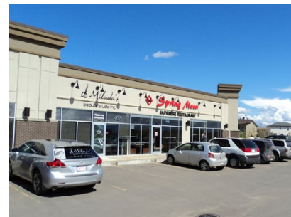
EAGLE RIDGE CORNER 151 LOUTIT RD FORT MCMURRAY, ALBERTA