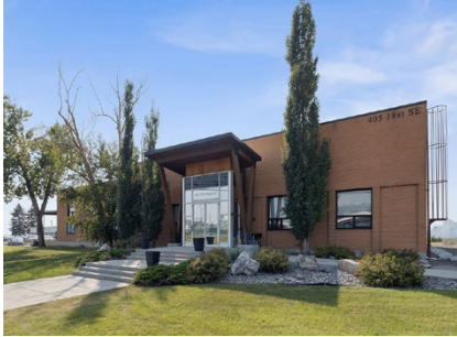
WSP BUILDING 405 -18 ST SE CALGARY, ALBERTA