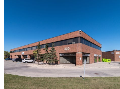
PRUDENTIAL PARK 2 530 CENTURY ST WINNIPEG, MB