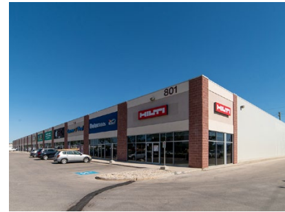
801 CENTURY ST 801 CENTURY ST WINNIPEG, MB