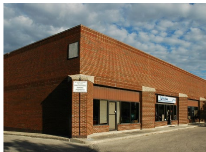
1832 KING EDWARD ST 1832 KING EDWARD ST WINNIPEG, MB