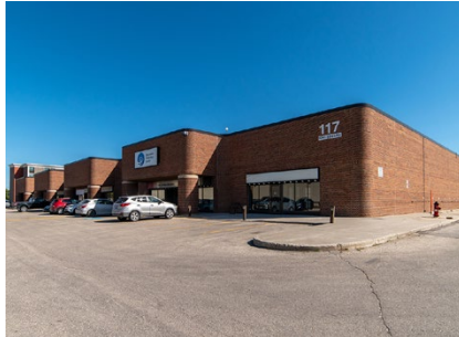
PRUDENTIAL PARK 1 117 KING EDWARD ST WINNIPEG, MB