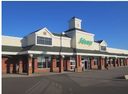
WOODLANDS CENTRE 300 THICKWOOD BLVD FORT MCMURRAY, ALBERTA