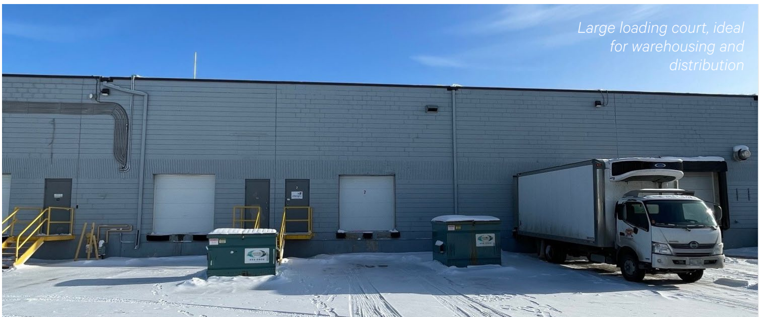
Large loading court, ideal for warehousing and distribution